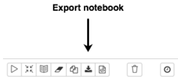
Figure 3.5. Zeppelin Export Icon