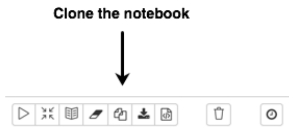
Figure 3.2. Zeppelin Clone Icon

Zeppelin displays a Clone note dialog box: