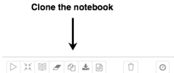
Figure 3.2. Zeppelin Clone Icon

Zeppelin displays a Clone note dialog box: