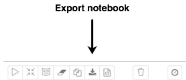
Figure 3.5. Zeppelin Export Icon