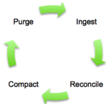
Figure 1.3. Data Ingestion Lifecycle

The base table is a Hive internal table, which was created during the first data ingestion. The incremental table is a Hive external table, which likely is created from .CSV data in HDFS. This external table contains the changes (INSERTs and UPDATES) from the operational database since the last data ingestion.