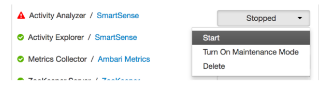
Issue 3 : In rare cases, SmartSense View may display the following error:

If the Restart All option is disabled, start each SmartSense component individually: