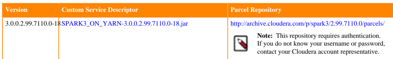
Table 1: Available CDS Versions